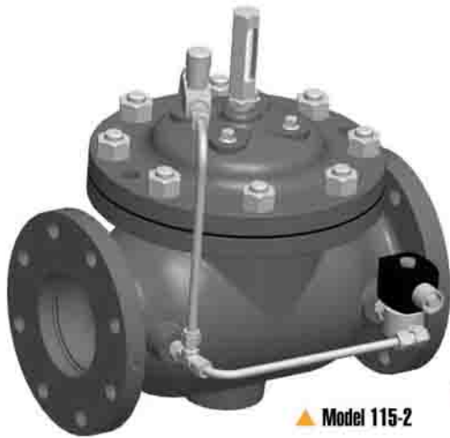
▲ Model 115-2