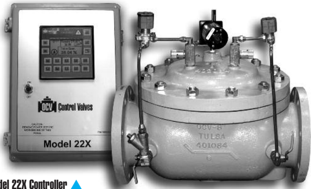
Model 22X Controller ▲ w/Model 115-3

The Model 22X Electronic Position Control Valve provides user percent of open control with extreme stability over a full range of flow. Combining the advantages of simplicity and line pressure operation with the features of electronic control, the valve is able to interface with SCADA systems to provide remote control and programmable variable logic. The electronic feature allows for a wider range of operation, simplifying valve sizing.