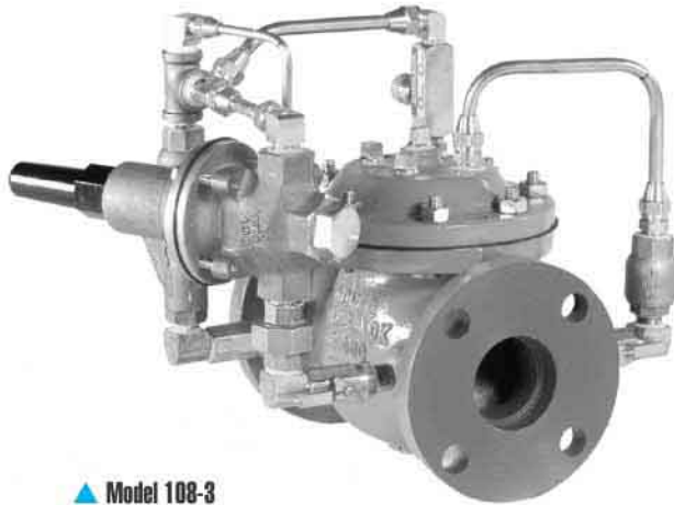
▲ Model 108-3

The Model 108-3 has a wide range of applications: anywhere a system must be protected from pressures that are too high (relief) or too low (sustaining) and reverse flow must be prevented.