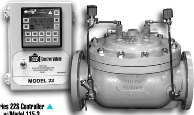
Series 22S Controller ▲ w/Model 115-3

The Model 22S Electronic Pressure Sustaining/Back Pressure Valve provides user pressure control with extreme stability over a wide range of flow. Combining the advantages of simplicity and line pressure operation with the features of electronic control, the valve is able to interface with SCADA systems to provide remote control and programmable variable logic. The electronic feature allows for a wider range of operation, simplifying valve sizing.