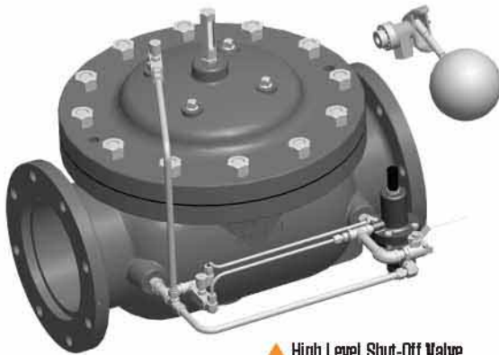
▲ High Level Shut-Off Valve Sizes: 6" - 24"

The Model 8104 is applicable anywhere it is necessary to automatically control the high level in storage tanks where the float pilot can be mounted inside the tank.