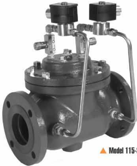
▲ Model 115-3

The Model 115-3 has a wide range of applications: anywhere it may be required to position a valve electrically.