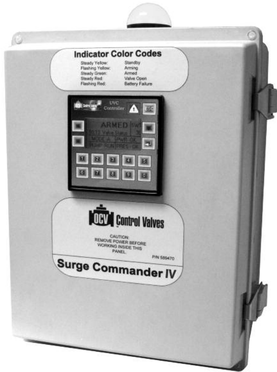
▲ Surge Commander IV shown

The OCV Surge Commanders are factory wired control panels that interface with any of the Series 118 Surge Control valves. All controllers are generally installed with minimal wiring between the surge control valve and the controller. Each controller is operated by the starting and stopping of the pump. It provides extra protection against surges associated with power failure or other pump failure by preemptively opening the valve in anticipation of the high pressure wave to follow.