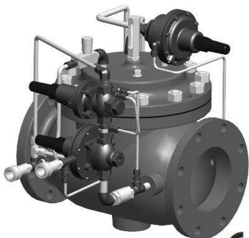
Model 114-3 ▲