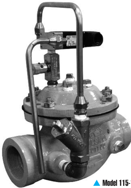
▲ Model 115-1NY

The Model 115-1NY is used in a water supply line in conjunction with fire sprinkler piping. Its basic purpose is to divert the potable water usage to the fire sprinkler line.