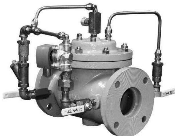
▲ Model 115-26

The Model 115-26 has an extremely wide range of applications: anywhere it is necessary to open and close a valve electrically and reverse flow must be prevented.