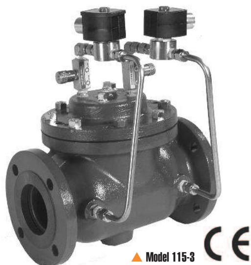
▲ Model 115-3

The Model 115-3 has a wide range of applications: anywhere it may be required to position a valve electrically.