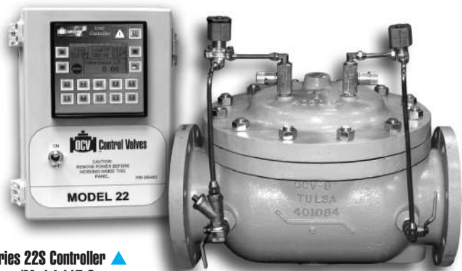
Series 22S Controller ▲ w/Model 115-3

The Model 22S Electronic Pressure Sustaining/Back Pressure Valve provides user pressure control with extreme stability over a wide range of flow. Combining the advantages of simplicity and line pressure operation with the features of electronic control, the valve is able to interface with SCADA systems to provide remote control and programmable variable logic. The electronic feature allows for a wider range of operation, simplifying valve sizing.