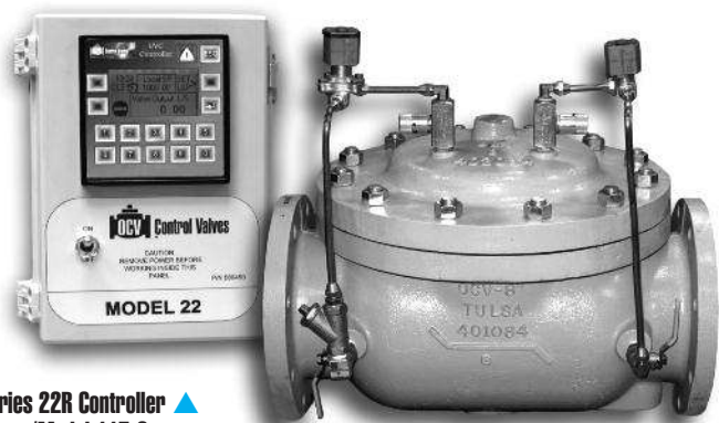
Series 22R Controller ▲ w/Model 115-3

The Model 22R Electronic Pressure Reducing Valve provides user pressure control with extreme stability over a wide range of flow. Combining the advantages of simplicity and line pressure operation with the features of electronic control, the valve is able to interface with SCADA systems to provide remote control and programmable variable logic. The electronic feature allows for a wider range of operation, simplifying valve sizing.