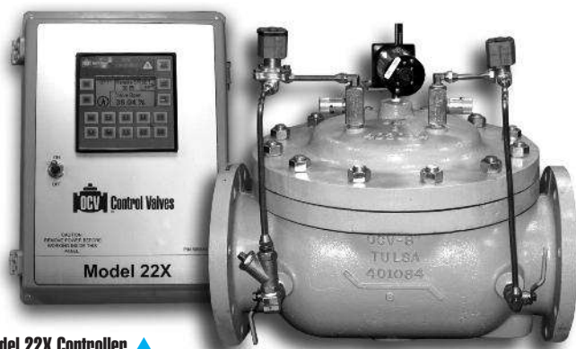
Model 22X Controller ▲ w/Model 115-3

The Model 22X Electronic Position Control Valve provides user percent of open control with extreme stability over a full range of flow. Combining the advantages of simplicity and line pressure operation with the features of electronic control, the valve is able to interface with SCADA systems to provide remote control and programmable variable logic. The electronic feature allows for a wider range of operation, simplifying valve sizing.