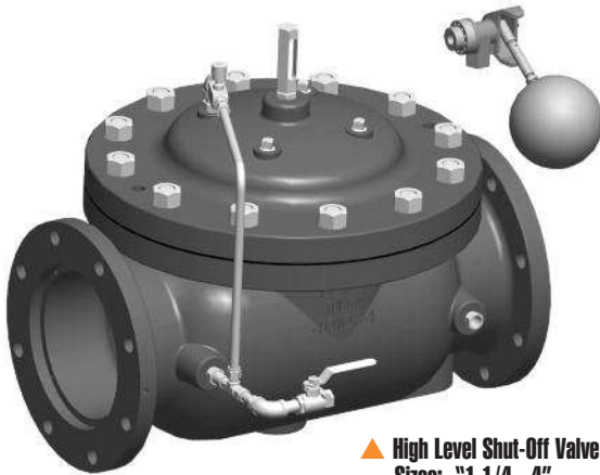
▲ High Level Shut-Off Valve Sizes: "1 1/4 - 4"

The Model 8101 is applicable anywhere it is necessary to automatically control the high level in storage tanks where the float pilot can be mounted inside the tank.