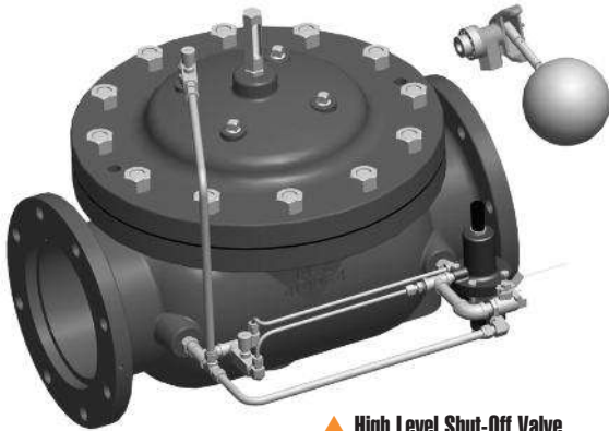
▲ High Level Shut-Off Valve Sizes: 6" - 24"

The Model 8104 is applicable anywhere it is necessary to automatically control the high level in storage tanks where the float pilot can be mounted inside the tank.