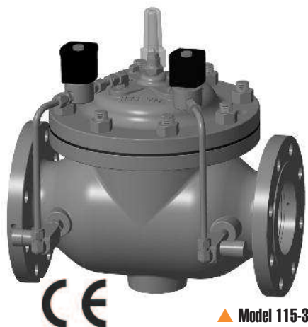
▲ Model 115-3

The Model 115-3 has a wide range of applications: anywhere it may be required to position a valve electrically.