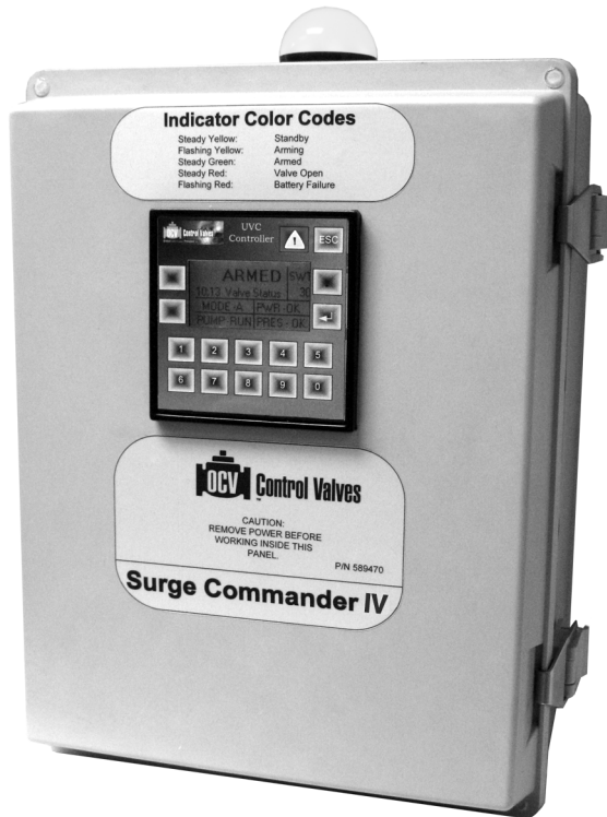
▲ Surge Commander IV shown

The OCV Surge Commanders are factory wired control panels that interface with any of the Series 118 Surge Control valves. All controllers are generally installed with minimal wiring between the surge control valve and the controller. Each controller is operated by the starting and stopping of the pump. It provides extra protection against surges associated with power failure or other pump failure by preemptively opening the valve in anticipation of the high pressure wave to follow.