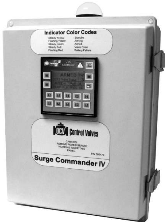
▲ Surge Commander IV shown

The OCV Surge Commanders are factory wired control panels that interface with any of the Series 118 Surge Control valves. All controllers are generally installed with minimal wiring between the surge control valve and the controller. Each controller is operated by the starting and stopping of the pump. It provides extra protection against surges associated with power failure or other pump failure by preemptively opening the valve in anticipation of the high pressure wave to follow.