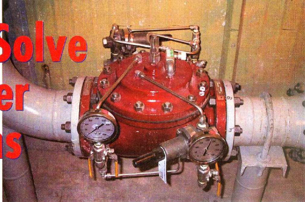
Figure 1. OCV Red Valve – shows two gauges.

Engineering Specialist, Fire and Gas, VECO Alaska, Inc.