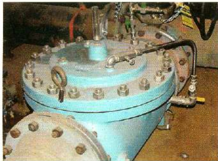
Figure 4. Blue Valve.

The control valve used here, and shown in Figure 1, is an OCV Series 127 pressure reducing flow control valve that controls water supply to the building sprinkler system. It controls flow and reduces the 275-psi supply pressure to 100 psi and sustains that pressure and flow in the fire system. Should the seawater fire main pressure