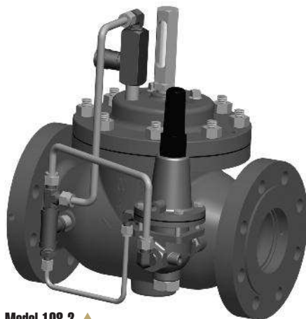
Model 108-2 ▲

The Model 108-2 has a wide range of applications: anywhere a system must be protected from pressures that are too high (relief) or too low (sustaining).