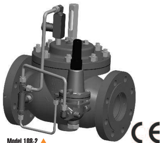
Model 108-2 ▲

The Model 108-2 has a wide range of applications: anywhere a system must be protected from pressures that are too high (relief) or too low (sustaining).