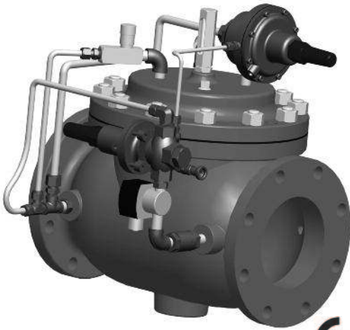
Model 114-1E ▲