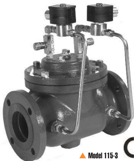
▲ Model 115-3

The Model 115-3 has a wide range of applications: anywhere it may be required to position a valve electrically.