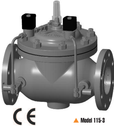
▲ Model 115-3

The Model 115-3 has a wide range of applications: anywhere it may be required to position a valve electrically.