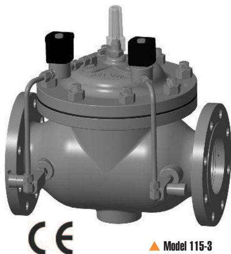
▲ Model 115-3

The Model 115-3 has a wide range of applications: anywhere it may be required to position a valve electrically.