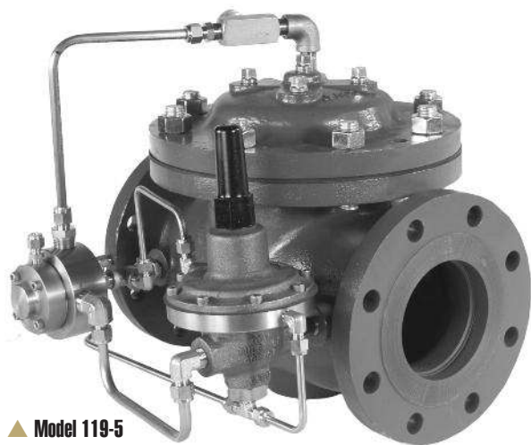
▲ Model 119-5

The Model 119-5 has a very specific purpose: to limit the flow of fuel through a filter separator and, in the event of high water levels in the filter separator sump, to close fully. To perform this task, the Model 119-5 must operate in conjunction with one of the OCV 800 series interface float pilots.