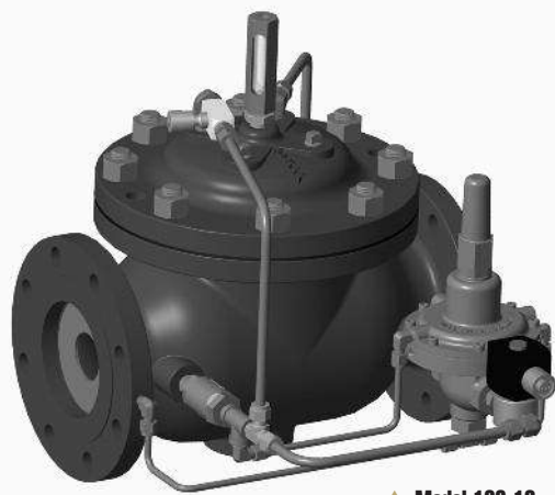
▲ Model 120-16

The Model 120-16 has a wide range of applications: anywhere the flow rate must be controlled or limited.