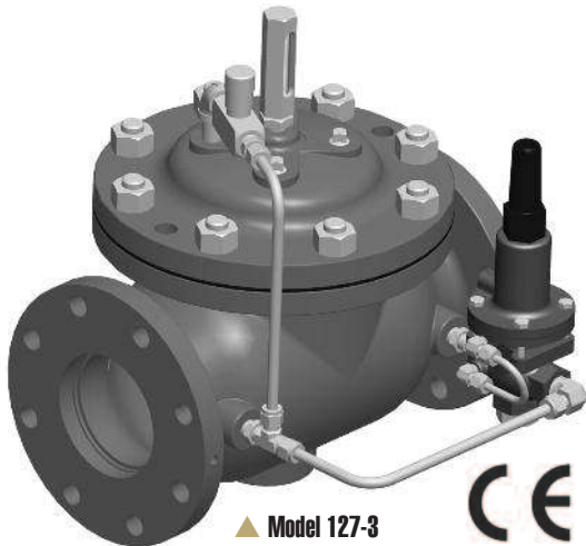
▲ Model 127-3

The Model 127-3 is applicable anywhere a pressure must be reduced to a manageable level in fuel delivery systems.