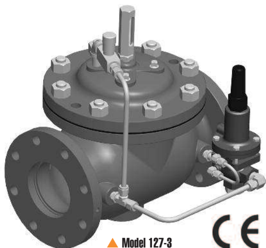
▲ Model 127-3