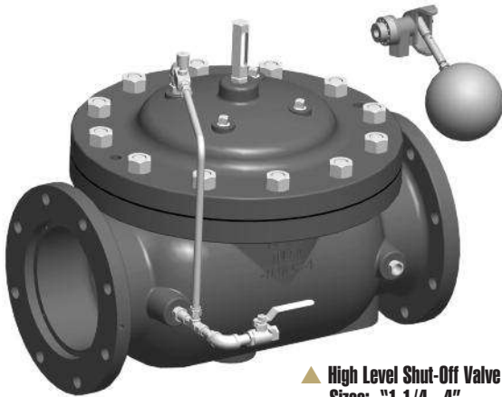
▲ High Level Shut-Off Valve Sizes: "1 1/4 - 4"

The Model 8101 is applicable anywhere it is necessary to automatically control the high level in storage tanks where the float pilot can be mounted inside the tank.