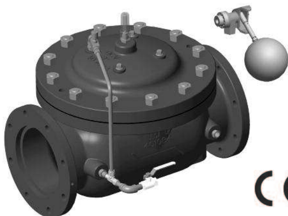
▲ High Level Shut-Off Valve Sizes: "1 1/4 - 4" (DN32-DN40 thru DN100)

The Model 8101 is applicable anywhere it is necessary to automatically control the high level in storage tanks where the float pilot can be mounted inside the tank.