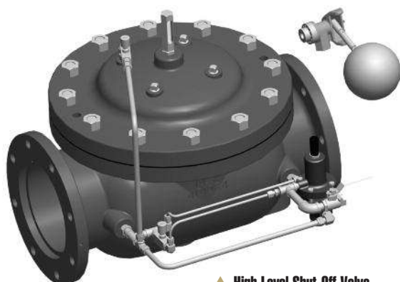
▲ High Level Shut-Off Valve Sizes: 6" - 24"

The Model 8104 is applicable anywhere it is necessary to automatically control the high level in storage tanks where the float pilot can be mounted inside the tank.