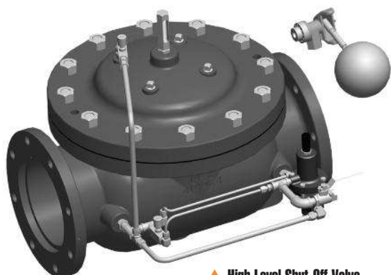
▲ High Level Shut-Off Valve Sizes: 6" - 24"

The Model 8104 is applicable anywhere it is necessary to automatically control the high level in storage tanks where the float pilot can be mounted inside the tank.