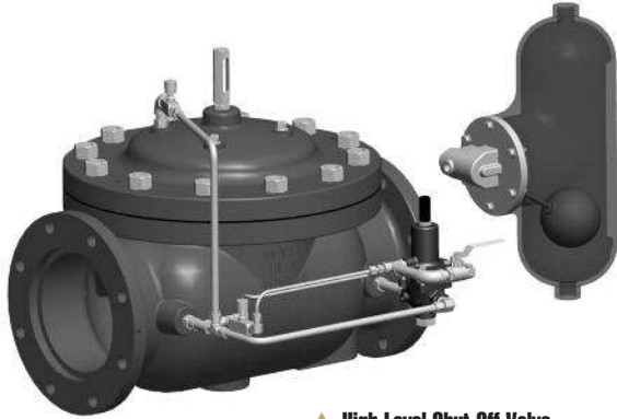
▲ High Level Shut-Off Valve Sizes: "4 - 24"

The Model 8106 is applicable anywhere it is necessary to automatically control the high level in storage tanks with floating pans, requiring that the float control be mounted on the exterior of the tank.