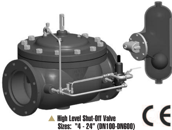
▲ High Level Shut-Off Valve Sizes: "4 - 24" (DN100-DN600)