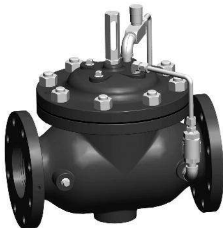
▲ Model 94-1QC

The Model 94-1QC non-surge check valve is a simple on/off valve which effectively minimizes pump start up surges. The 94-1QC opens at an adjustable speed to allow forward flow and closes quickly and tightly to prevent reverse flow.