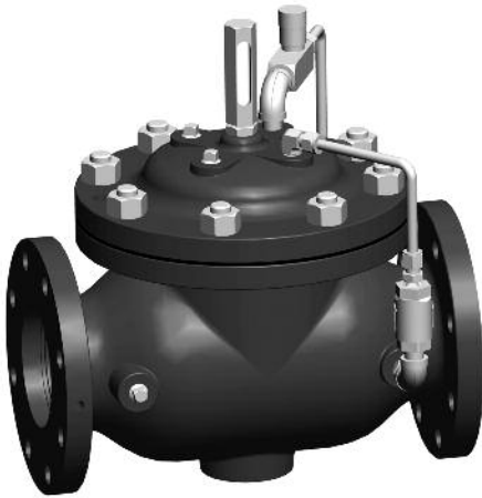
▲ Model 94-1QC

The Model 94-1QC non-surge check valve is a simple on/off valve which effectively minimizes pump start up surges. The 94-1QC opens at an adjustable speed to allow forward flow and closes quickly and tightly to prevent reverse flow.