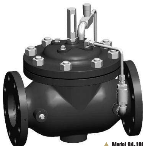
▲ Model 94-1QC

The Model 94-1QC non-surge check valve is a simple on/off valve which effectively minimizes pump start up surges. The 94-1QC opens at an adjustable speed to allow forward flow and closes quickly and tightly to prevent reverse flow.