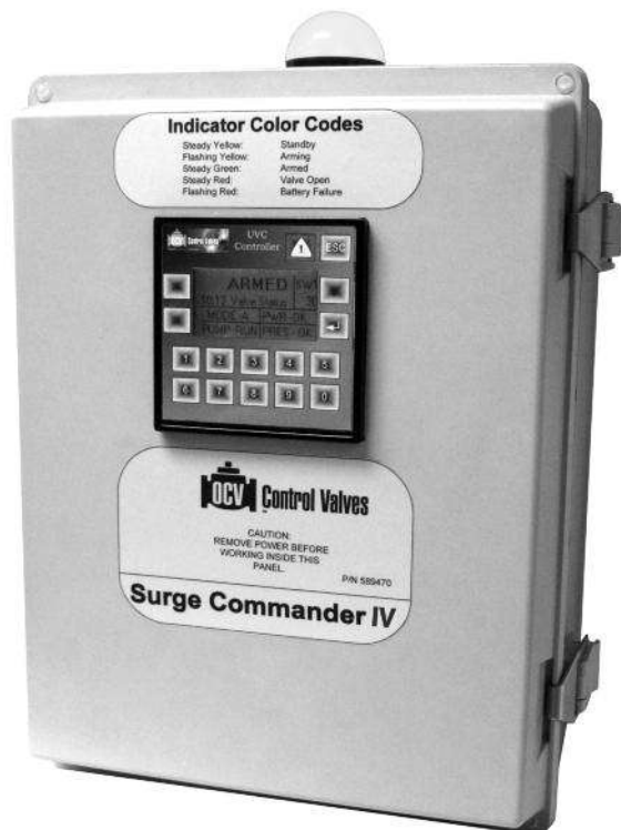
▲ Surge Commander IV shown

The OCV Surge Commanders are factory wired control panels that interface with any of the Series 118 Surge Control valves. All controllers are generally installed with minimal wiring between the surge control valve and the controller. Each controller is operated by the starting and stopping of the pump. It provides extra protection against surges associated with power failure or other pump failure by preemptively opening the valve in anticipation of the high pressure wave to follow.