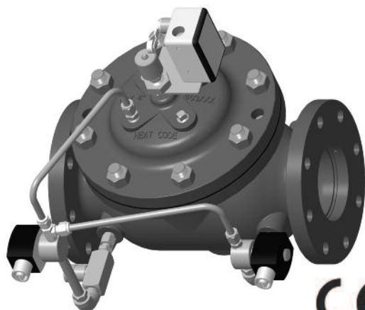
Two-Stage Preset Valve ▲

The Model 115-5S is specifically designed for fuel loading systems and performs the following functions: