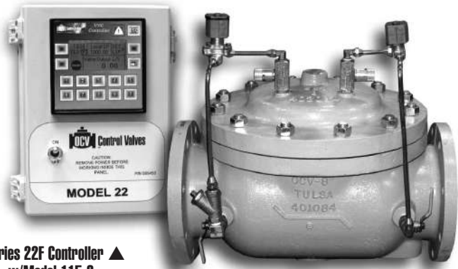
Series 22F Controller ▲ w/Model 115-3

The Model 22F Electronic Flow Control Valve provides user flow control with extreme stability over a wide range of flow. Combining the advantages of simplicity and line pressure operation with the features of electronic control, the valve is able to interface with SCADA systems to provide remote control and programmable variable logic. The electronic feature allows for a wider range of operation, simplifying valve sizing.