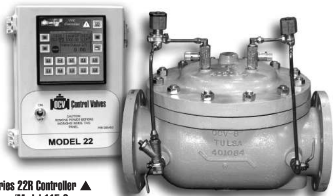
Series 22R Controller ▲ w/Model 115-3

The Model 22R Electronic Pressure Reducing Valve provides user pressure control with extreme stability over a wide range of flow. Combining the advantages of simplicity and line pressure operation with the features of electronic control, the valve is able to interface with SCADA systems to provide remote control and programmable variable logic. The electronic feature allows for a wider range of operation, simplifying valve sizing.