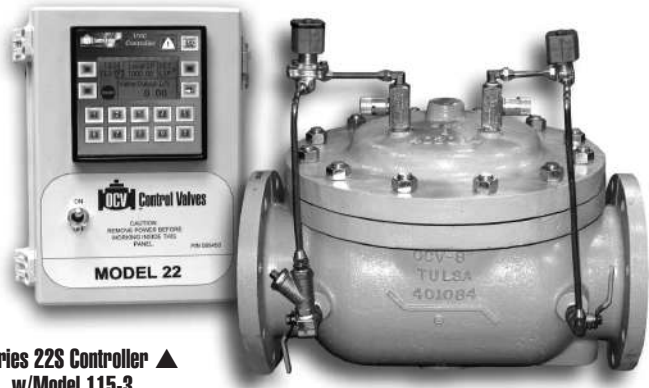
Series 22S Controller ▲ w/Model 115-3

The Model 22S Electronic Pressure Sustaining/Back Pressure Valve provides user pressure control with extreme stability over a wide range of flow. Combining the advantages of simplicity and line pressure operation with the features of electronic control, the valve is able to interface with SCADA systems to provide remote control and programmable variable logic. The electronic feature allows for a wider range of operation, simplifying valve sizing.