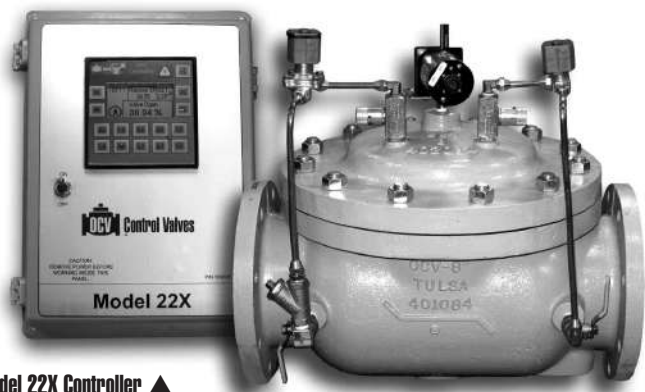
Model 22X Controller ▲ w/Model 115-3

The Model 22X Electronic Position Control Valve provides user percent of open control with extreme stability over a full range of flow. Combining the advantages of simplicity and line pressure operation with the features of electronic control, the valve is able to interface with SCADA systems to provide remote control and programmable variable logic. The electronic feature allows for a wider range of operation, simplifying valve sizing.