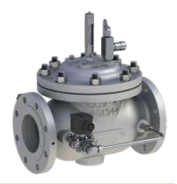
OCV 114-1 Hydrant Control Valve for Hose Truck Systems