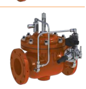
OCV 127-9S Two-Stage Preset Valve